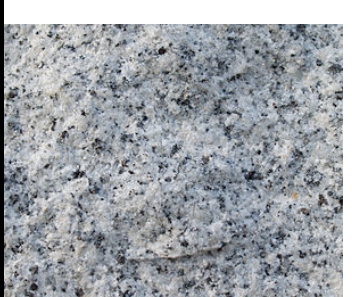
Granite - interlocking crystals (black, grey white and/or pink) give it a speckled look.