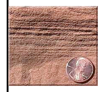
Sandstone - Look for r sugary to the touch