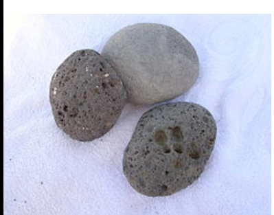
Basalt - Black rock. There may be a few scattered crystals, but most too small to see. May have holes (vesicles).