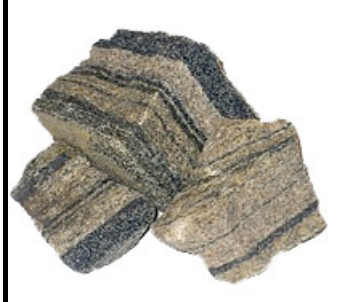
Gneiss - Has Light/dark stripes or bands.