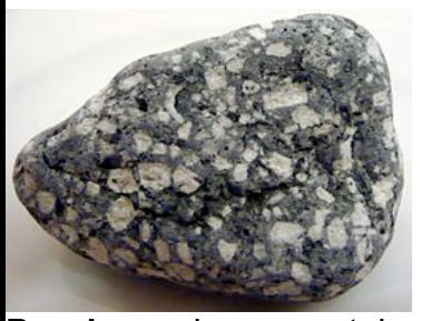
Porphyry - large crystals, often black and needle-like and/or white and rectangular, floating in a fine grained background (matrix).